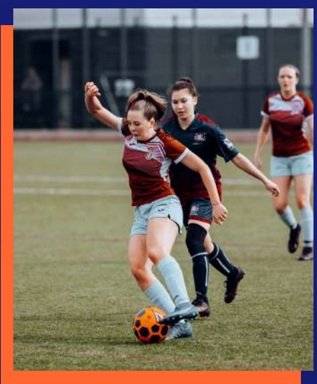
Enquire for more details on further opportunities